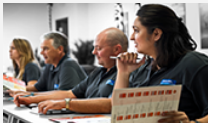
Local Training and Events

For questions or help with registration, please contact midaservice@RexelUSA.com .