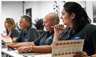
Local Training and Events

For questions or help with registration, please contact midaservice@RexelUSA.com .