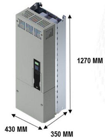
PowerFlex® 755TS Frame 7A

For questions, please contact Cliff.Gilliland@RexelUSA.com or Ryan.Clouse@RexelUSA.com .