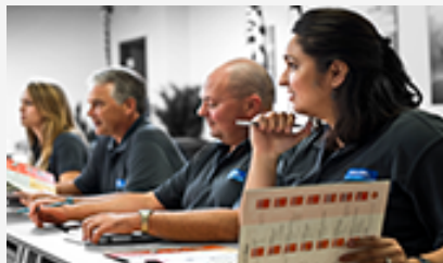
Local Training and Events

For questions or help with registration, please contact midaservice@RexelUSA.com .