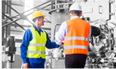
Automation Line Card