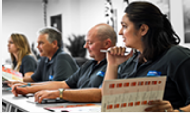
Local Training and Events