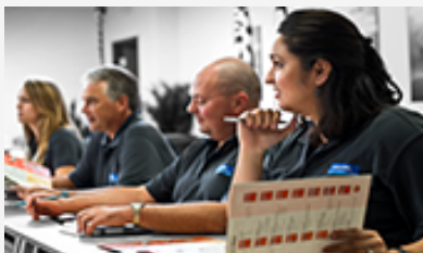
Local Training and Events

Missed a newsletter? Check out our newsletter archive here .