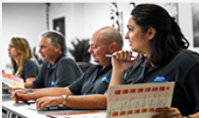
Local Training and Events

Missed a newsletter? Check out our newsletter archive here .