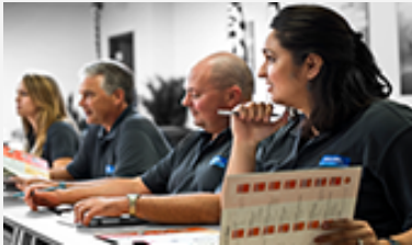
Local Training and Events

Missed a newsletter? Check out our newsletter archive here .